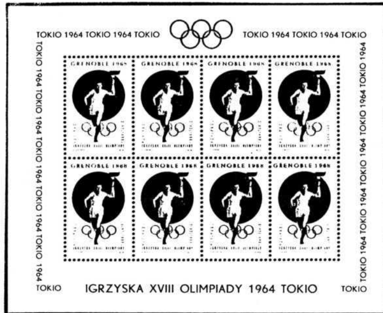
No.17, a sheet of eight

17. Same as sheet No.98 of the "1964 - Tokyo" section except GRENOBLE 1968 is added across top of each label.