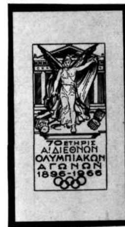
1968 - GRENOBLE (10th Olympic Winter Games)