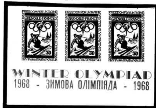
No. 4, Bottom of Imperf Sheet